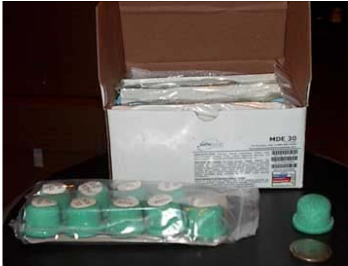
MDE-30 Adhesive Backed Emitters 50 UNITS/Box

Type: Durable open cell emitters withstand conditions of high relative humidity and temperature.