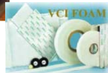
VCI adhesive backed foams in easy to use tape construction