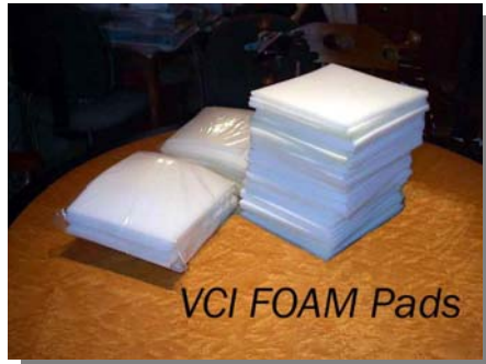
VCI FOAM Pads