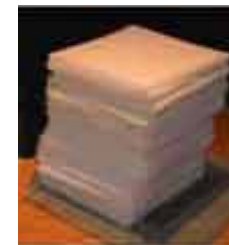
VCI Emitting Foam Inserts available in a variety of sizes

Inhibits rust, oxidation and corrosion, protecting the metal surface from the effects of corrosion catalysts such as humidity, moisture, chlorides, salts, hydrogen sulphide, sulphur dioxide, ammonia or acid rain.